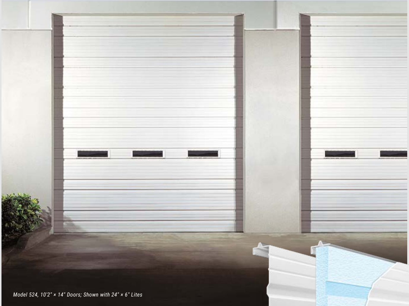
Model 524, 10'2" x 14" Doors; Shown with 24" x 6" Lites